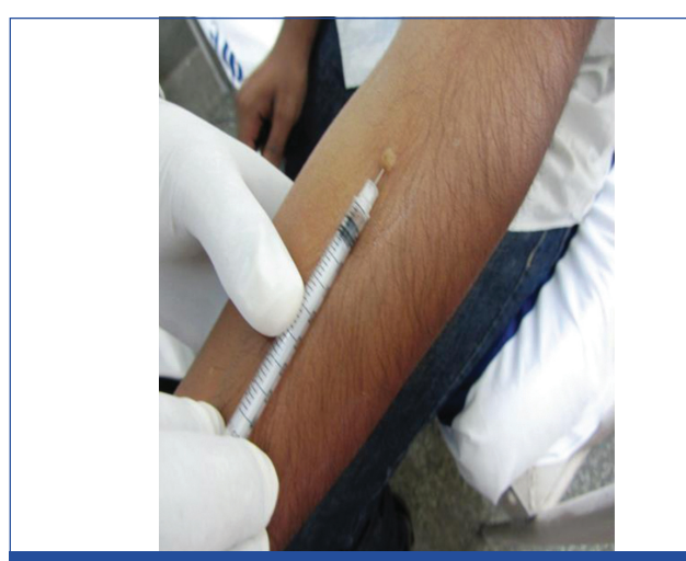
[Table/Fig-1]: ASST test being performed in a study subject.

After stopping all antihistamines for a minimum of three days, ASST was conducted by injecting 0.1 mL of patient's own serum and saline control intradermally into the flexor aspect of the forearm, 5 cm apart [Table/Fig-1]. A difference of >1.5 mm between the wheal diameters elicited by the autologous serum and saline, read after 30 minutes was considered positive ASST. Two equal age and sex matched groups of ASST positive and ASST negative patients were included in the study.