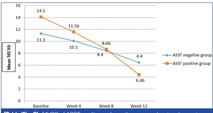
[Table/Fig-7]: MUSS of ASST positive and negative groups showing decreasing trend with monthly AWBT.

Majority of patients from both the groups reported either good or excellent improvement at the end of 12 weeks. One patient from ASST negative group reported poor improvement [Table/Fig-9]. There was a statistically significant difference in subjective response